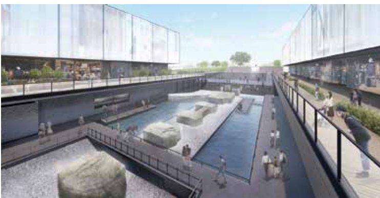
Rendering image for Remnants of Lung Tsun Stone Bridge Preservation Corridor