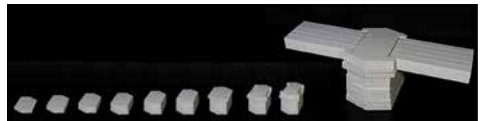
3D model of the remnants