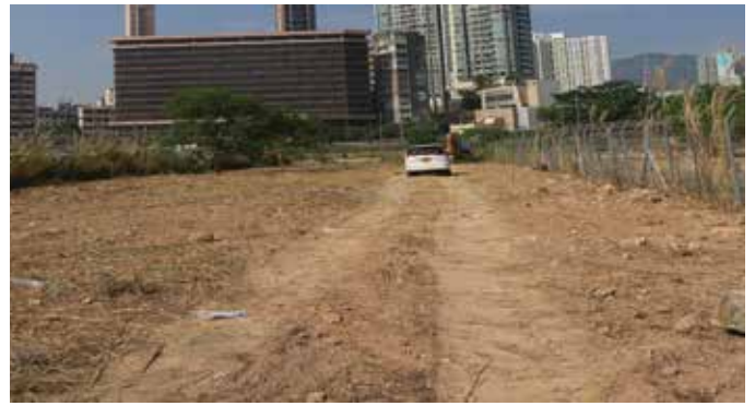
Existing condition of Kai Tak Development