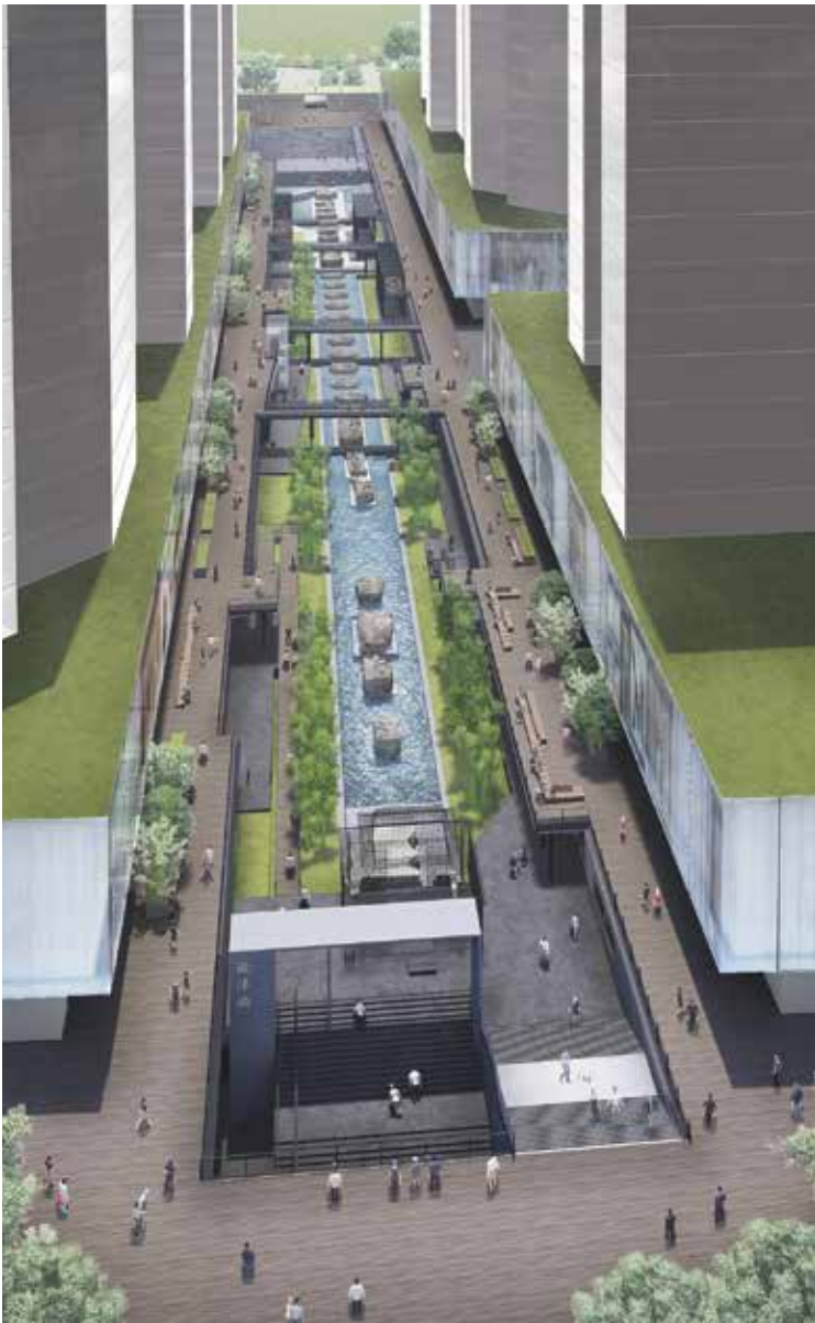
Rendering image for overall view of Lung Tsun Stone Bridge Preservation Corridor Image Courtesy of Architectural Services Department, HKSAR Government