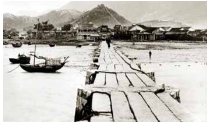
Old photo of Lung Tsun Stone Bridge Preservation Corridor