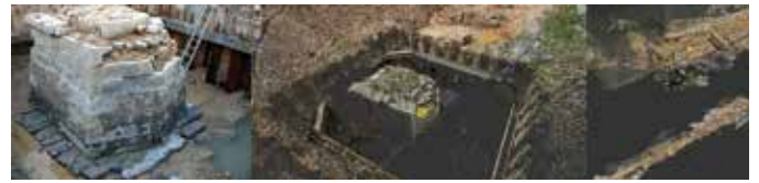
Point Cloud Scanning the Profile of Remnants on Site by CEDD and Documenting the information of Remnants in BIM Model using Autodesk ReCap.