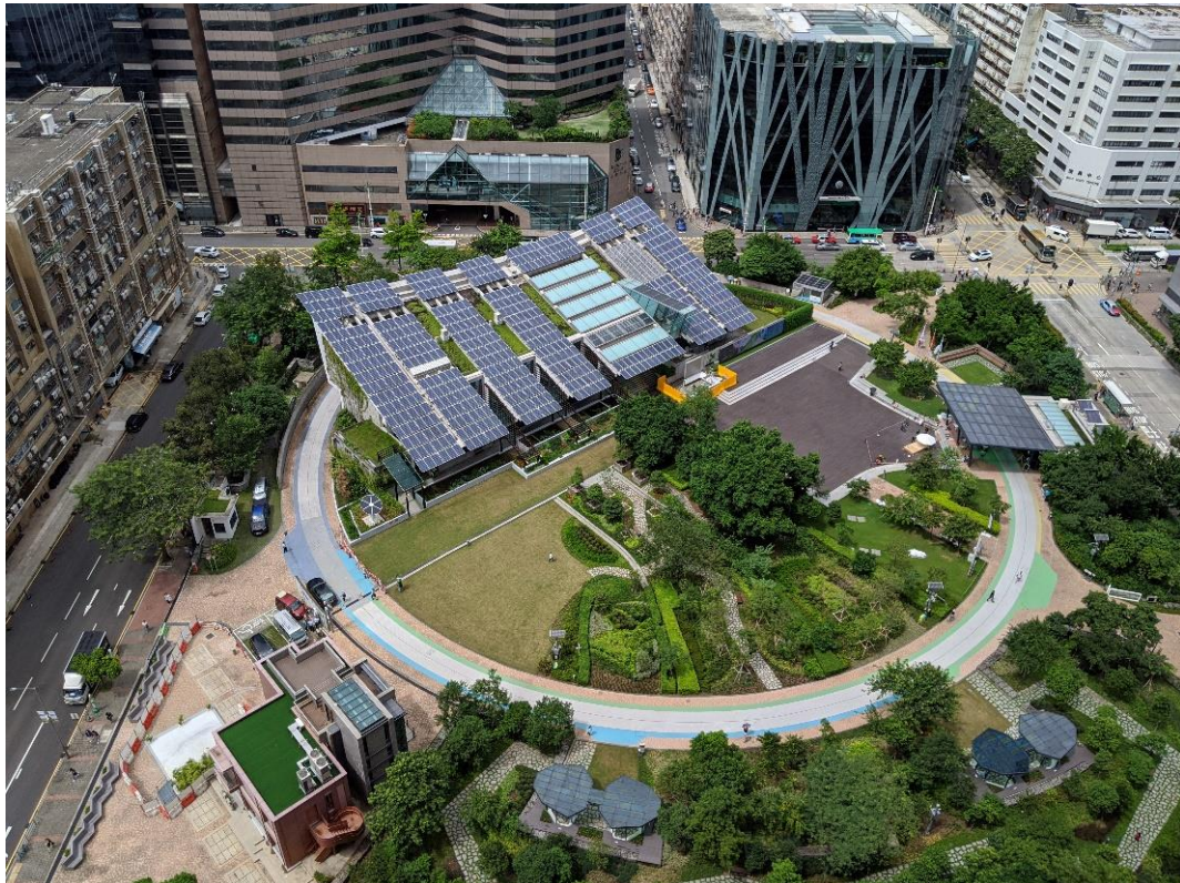
The Existing CIC-ZCP